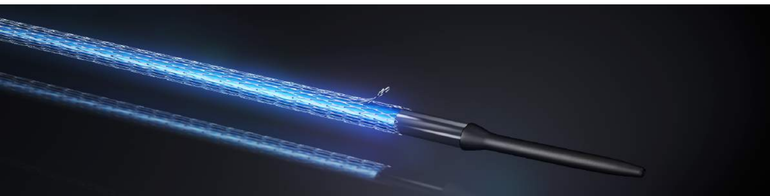
An example of a stent damaged during transportation